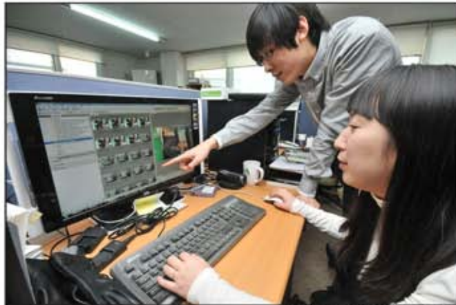
@ the Daily NK office

South Korea is the world's most wired country where almost two-thirds of the population uses smartphones. As such, redesigning the Daily NK site so it's able to deliver news and information on different platforms by way of Responsive Web Design (RWD) is crucial to generating more web traffic and enhancing user-interactivity via SNS. Also important, more and more North Koreans use mobile phones (albeit with severely restricted service). We want to be there when the firewall falls, as it will, and deliver information the fastest and most effective way possible.