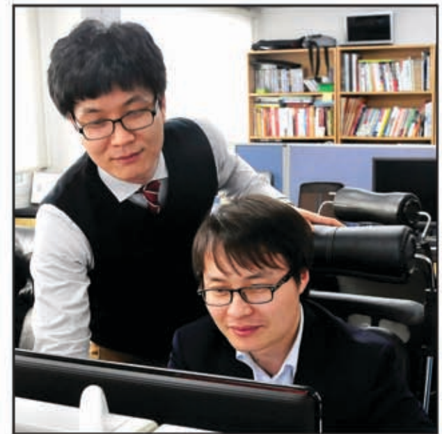
(President Park. left)

A real turning point for me was South Korea's 1993 presidential election. Democracy activist Kim Young Sam was elected to office freely and fairly, but North Korea launched a smear campaign to undermine his legitimacy. Why? Day after day North Korea's propaganda judged Kim Young Sam as a "traitor" yet the South Korean people voted for him as their representative. In this way, North Korea's propaganda was an insult to the democratic process and I lost faith in the utopian vision I embraced earlier. Over the next year my views changed dramatically with the death of Kim Il Sung, the collapse of North Korea's planned economy, and the influx of defectors into South Korean society.