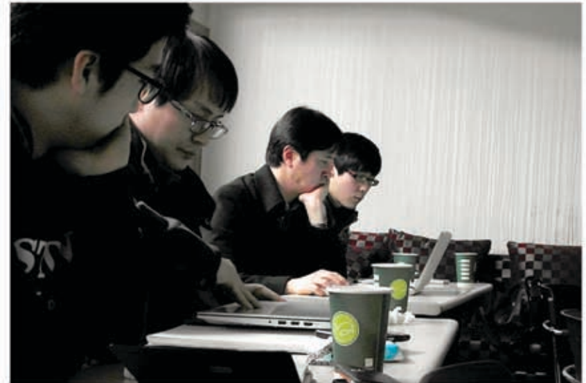
(Daily NK reporters at work)

Yes. As a young person, I learned both sides of the DMZ adopted tactics of terror and believed the North must have had some reason for pursuing aggression. The 1987 bombing of Korean Air Flight 858 by North Korean agents, for example, may seem akin to the bombing of British pubs by Irish nationalists during The Troubles. But the Korean People’s Army (KPA) is not the Irish Republican Army (IRA), and the North Korean regime is more interested in survival than national independence. 9/11 was another turning point. Everyone felt great anger and sadness for America, understanding targeting innocent civilians to achieve political goals is totally unacceptable. The North Korean regime’s liberal use of terror on its own people and the international community fostered associations with 9/11 that hit deep with me. Many Americans felt the same rage and sadness we felt after Gwangju. Now it’s clear we all want to see positive change