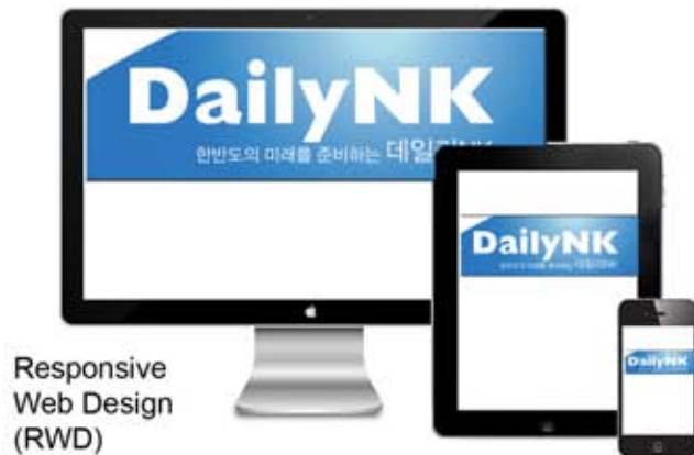
Responsive Web Design (RWD)