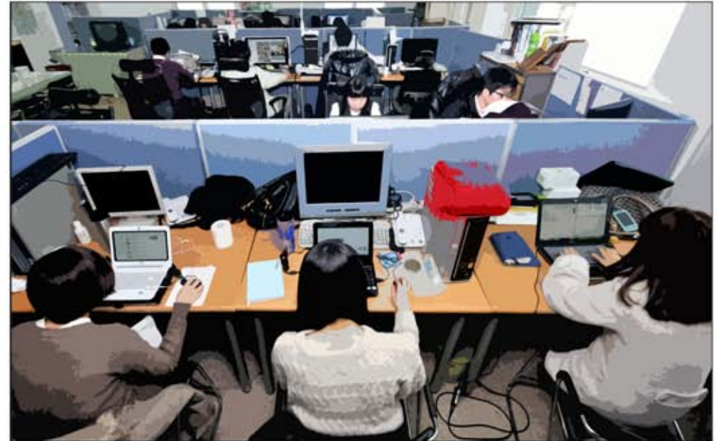
@ the Daily NK office